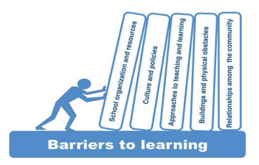
Figure 1. Barriers to learning.4

Barriers created because of the school organization could be lack of leadership